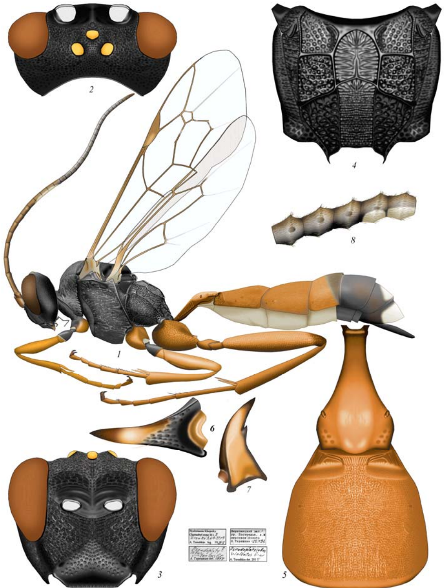
Plate 1: Pseudoplatylabus violentus (GRAVENHORST, 1829), ♀, ♂ (8).